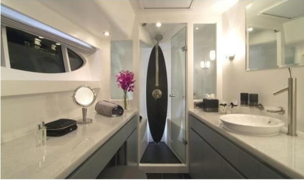
Manufacturer Provided Image: Master Bath