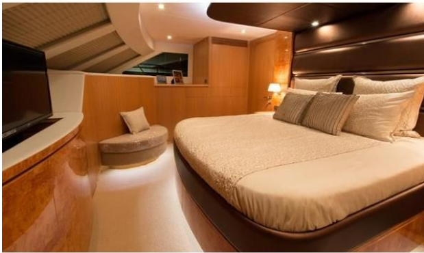
Master Stateroom A