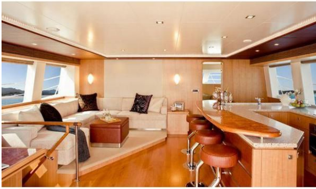
Main Salon A