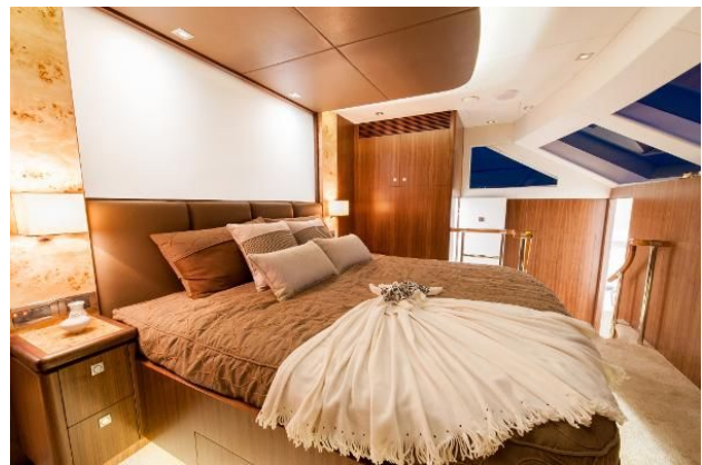
Master Stateroom B