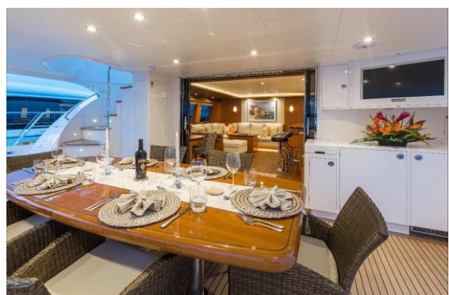
Manufacturer Provided Image: Aft Deck