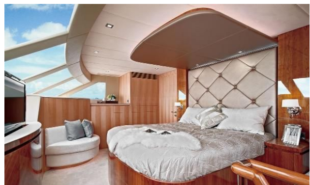
Manufacturer Provided Image: Master Stateroom D