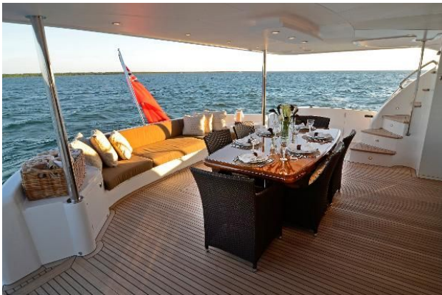
Manufacturer Provided Image: Aft Deck