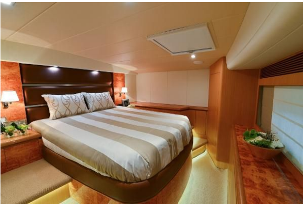
VIP Stateroom B