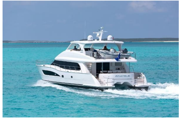
PC60 Profile Stern