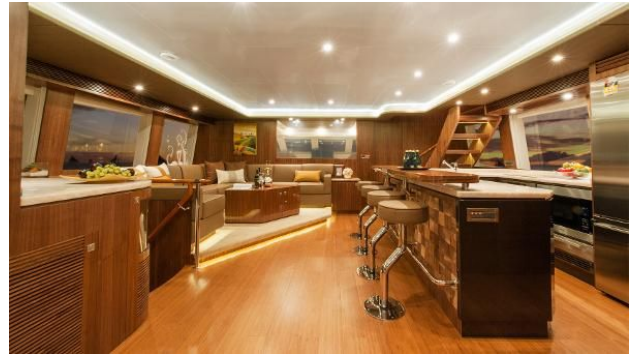
Manufacturer Provided Image: Main Salon C