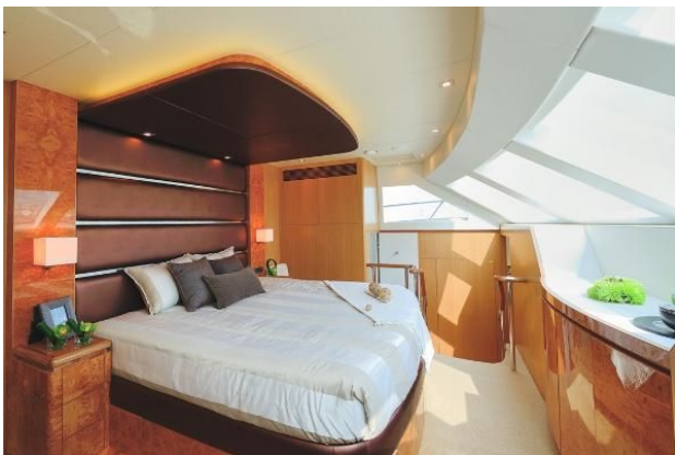
Master Stateroom C