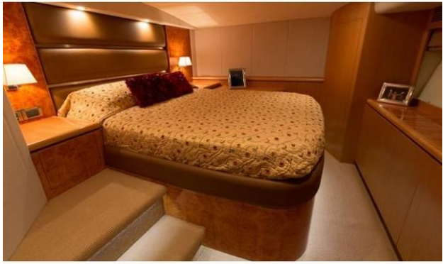
VIP Stateroom A