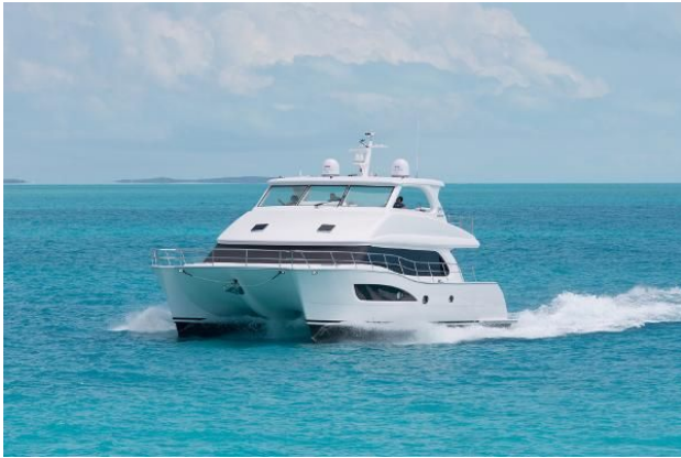
PC60 Profile Bow