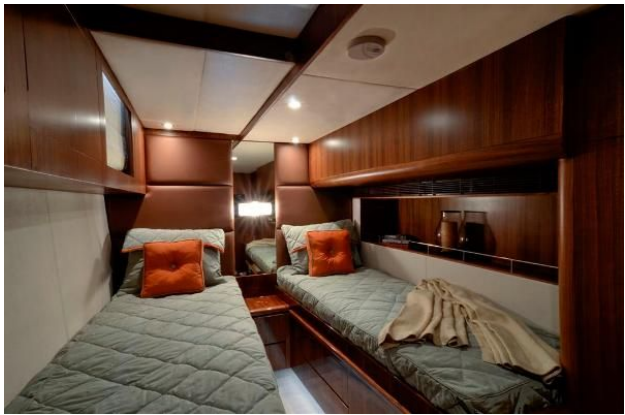
Twin Guest