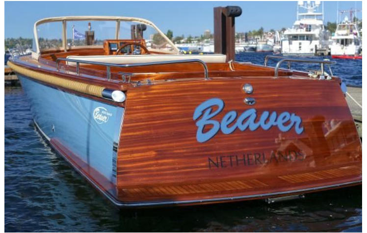
Crusing the San Juan Islands