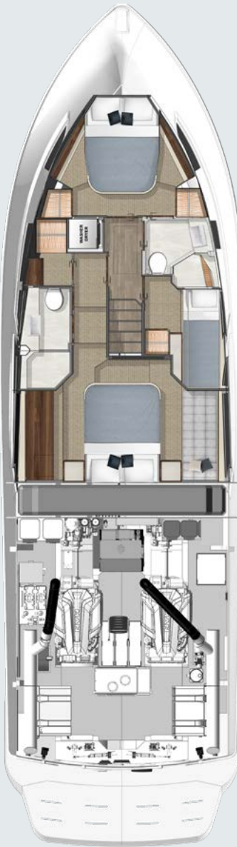
MAN Shaft Drive option Gyro (optional)