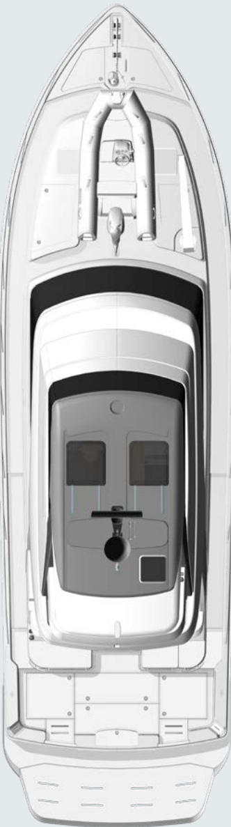
Tender and Davit (optional)