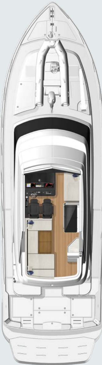
Foredeck Sunpad (optional)