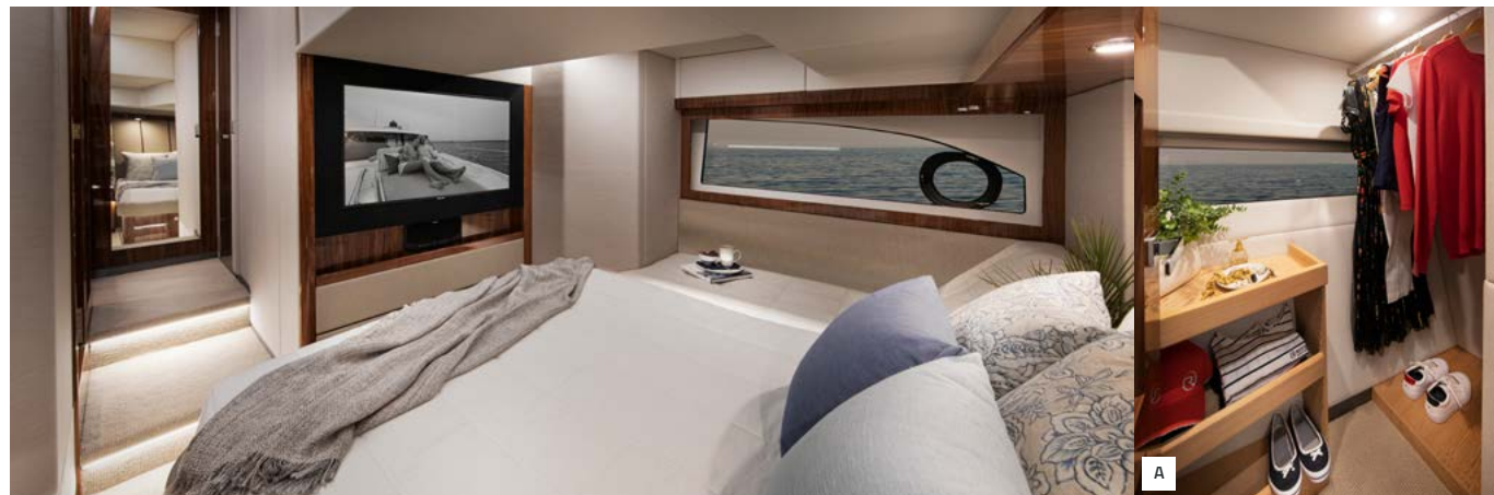
A Master Stateroom walk-in-robe