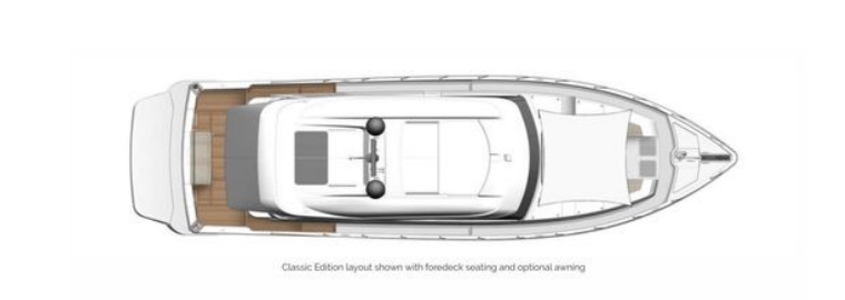
Classic Edition layout shown with foredeck seating and optional awning