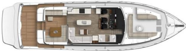
Classic Edition shown with foredeck seating, optional starboard Club Lounge and bait tank in lieu of transom lounge