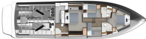
Classic 4 cabin layout with utility/laundry room