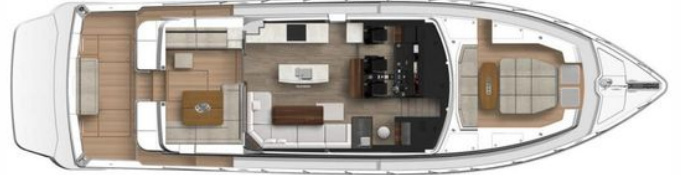
Newport Edition shown with optional foredeck seating and teak