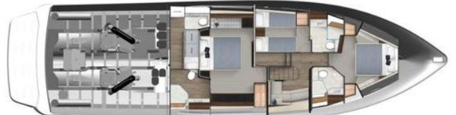
Optional Lower lounge with single crew cabin/laundry